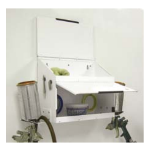
Spray Booth Accessories